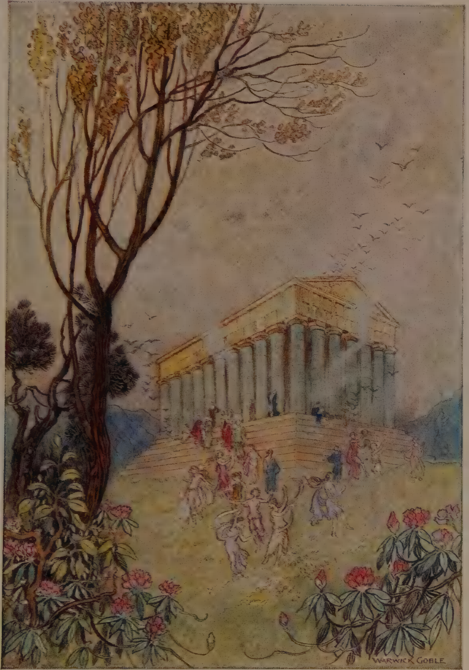
THE PARLIAMENT OF BIRDS